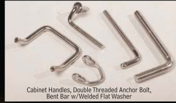
Cabinet Handles, Double Threaded Anchor Bolt, Bent Bar w/Welded Flat Washer

With the expertise provided by our trained design and manufacturing teams, you can count on your parts being fabricated to your exact specifications in a timely and professional manner. We remain committed to the quality control and reliability required to meet and exceed your expectations and standards.