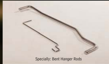
Specially: Bent Hanger Rods