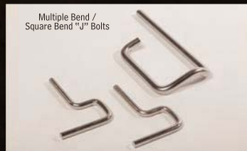
Multiple Bend / Square Bend "J" Bolts