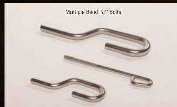
Multiple Bend "J" Bolts